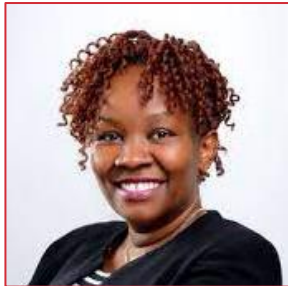
Nana Kimemia Electra Arrow Customer Experience

We utilise the skills & expertise of External Consultants, with whom we've partnered to create & deliver high impact, industry relevant people development solutions. Our consultant-based training model allows for the infusion of a vast wealth of hands-on and current industry experience together with the acquired training skills & abilities